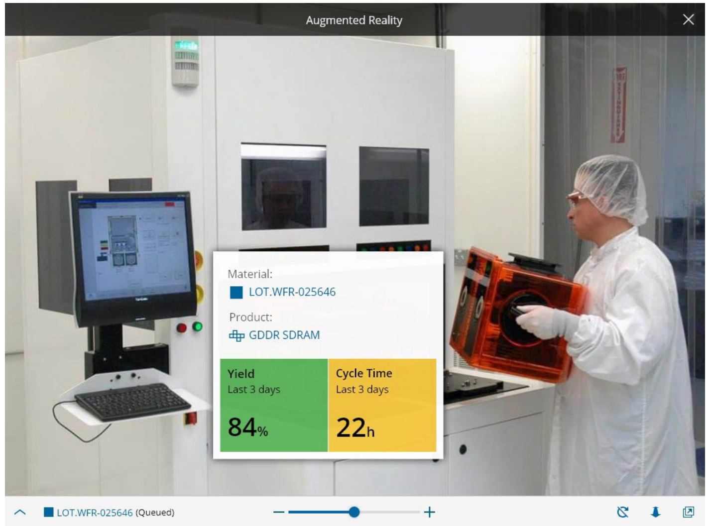
Figure 2 Augmented Reality example