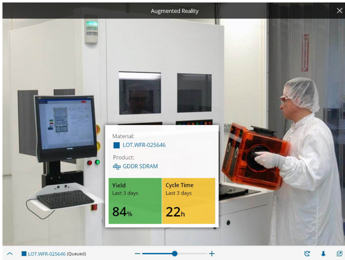
Figure 2 Augmented Reality example