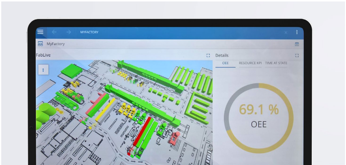
Figure 2 fabLIVE running on an Android tablet