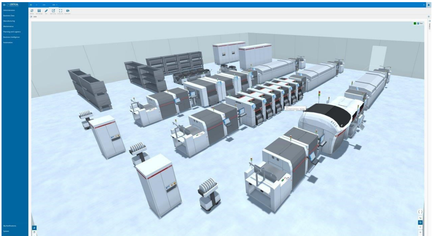
Figure 1 fabLIVE example

fabLIVE allows the customer to design the real physical layout of the plant and then to monitor the equipment with instantaneous updates delivered using a publish/subscribe mechanism.