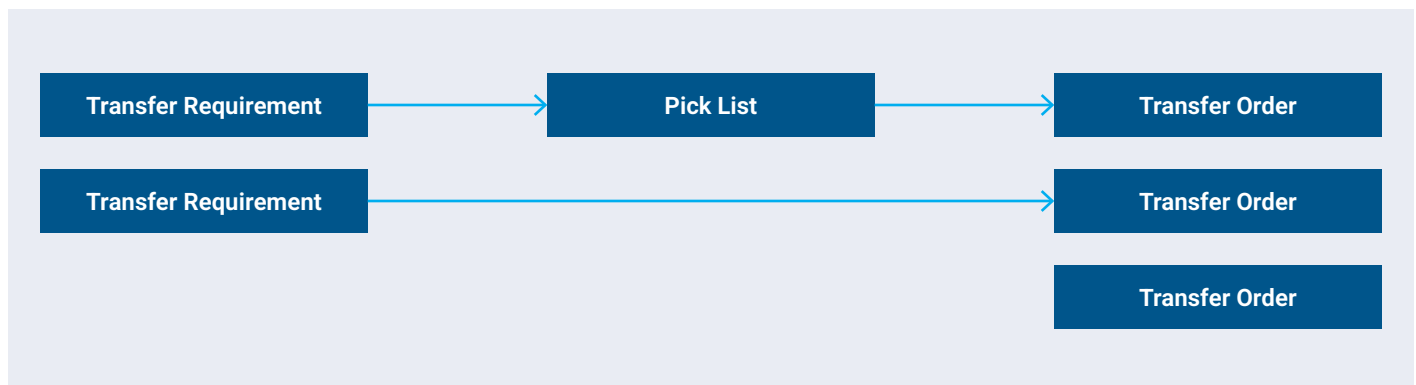
Figure 1 Material Logistics Lifecycle options

The Material Logistics module performs automatic replenishment based on user defined reorder points and target inventory levels and also provides the capability to take periodic inventories.